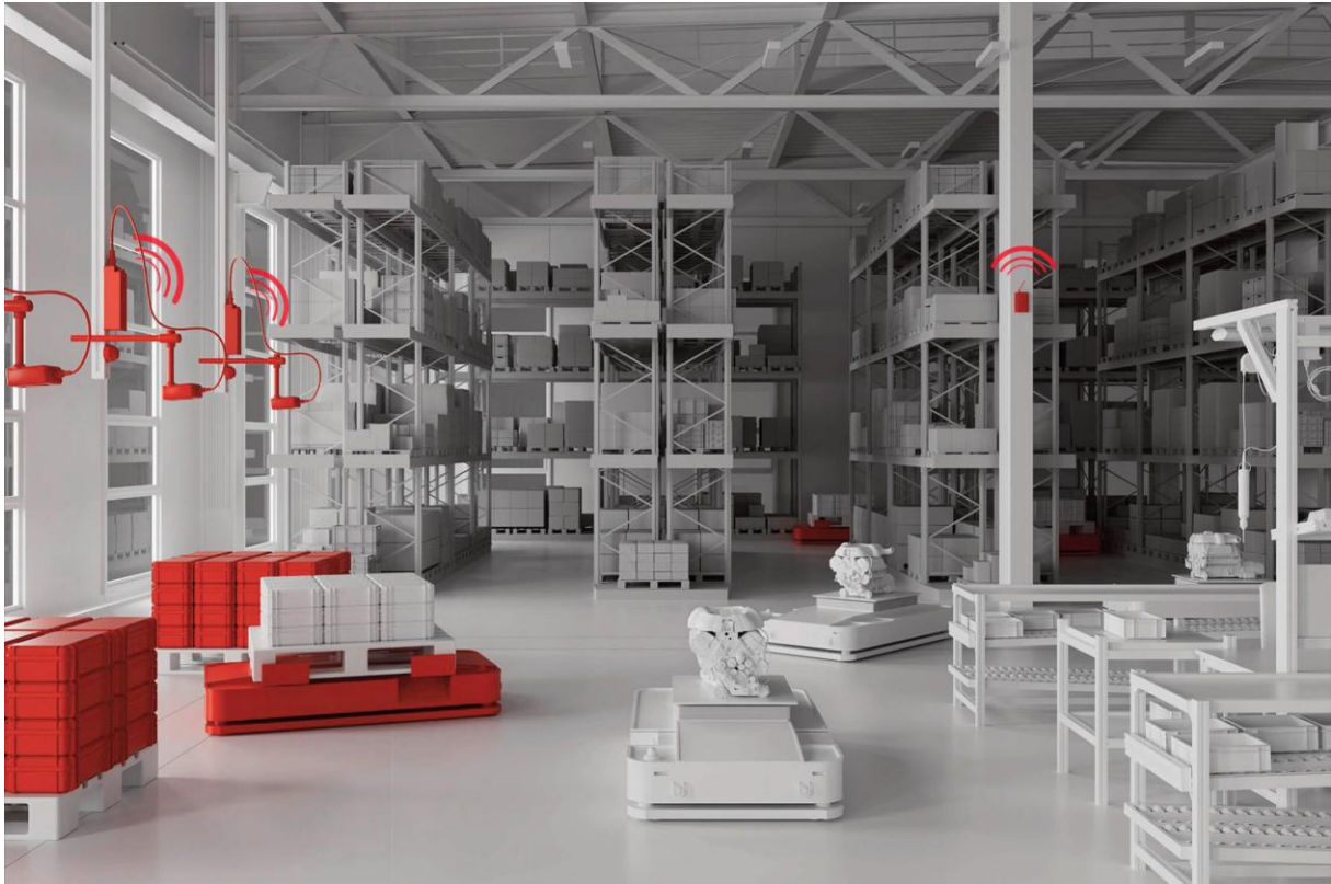
01 The wireless-based automated material requisition system (AMS) sWave.NET® controls the replenishment of non-inventory-managed materials or components.