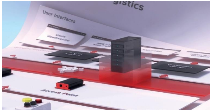
06 The "on-premise" version of sWave.NET® requires no additional hardware – i.e. no industrial PC.

(autonomous mobile robots) or dollies can also be integrated in the AMS (Fig. 5), as can transfer points between mobile and stationary conveyors. The result is an uninterrupted and real-time visualisation of the entire material flow, without having to monitor every single component individually. The infrastructure requires just a few elements which, if necessary, can easily and quickly be mounted in a new location – for example when the shop floor layout is modified or redesigned.