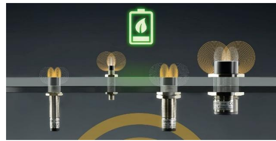
07 A new series of inductive wireless sensors with digital autocalibration is suited to both flush and non-flush mounting.

A new wireless foot switch series uses a low-energy wireless system developed by steute, featuring a long range and achieving high transmission reliability even in often adverse industrial conditions (multiple radiation, coexistence with other wireless systems). In addition – compared to the previous series – energy consumption could be reduced by as much as 50 %. This is facilitated by long battery runtimes between charging cycles.