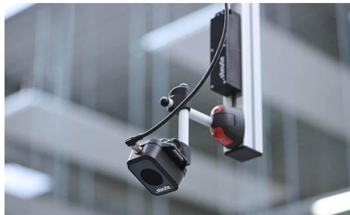
03 View from above: long-range sensors detect free parking slots in material supermarkets. Easily visible: the separate battery and wireless module.