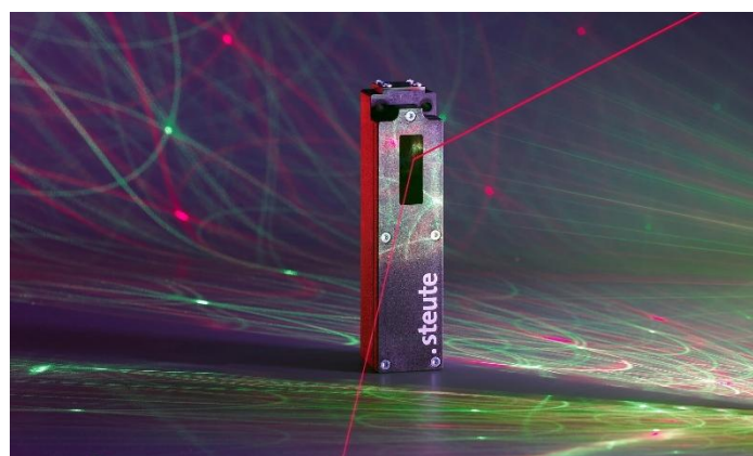
04 Part of the replenishment management: laser sensors detect e.g. containers or fill levels.